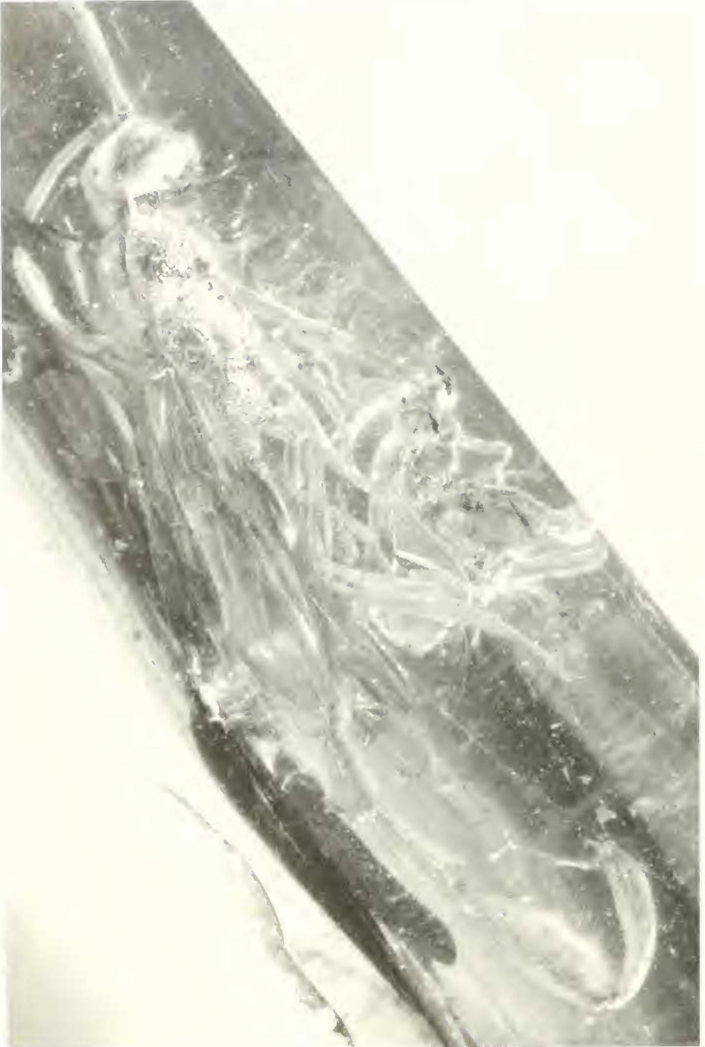
Fig. 1. Photomicrograph of Pelecinopteron tubuliforme Brues (AMNH).